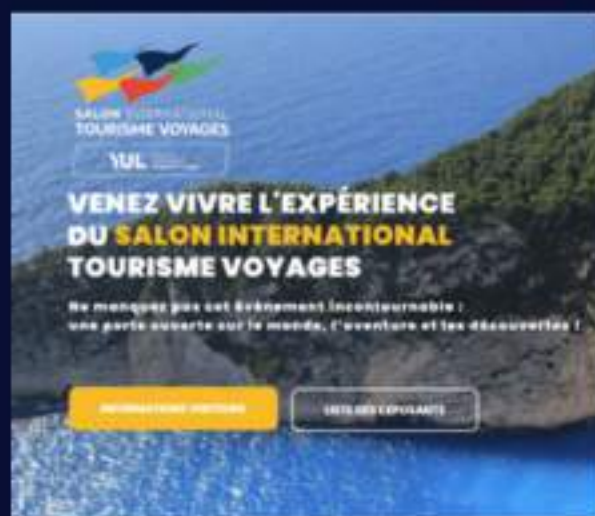
Website and social medias