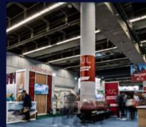
Onsite signage and promotional material