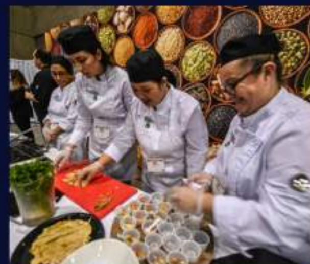
Cooking Stage Presentations